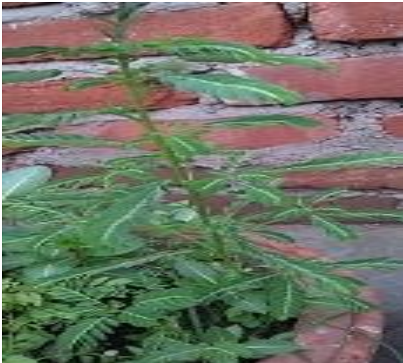
Fig:Habitat of Phyllanthus amarus in a garden as a weed.