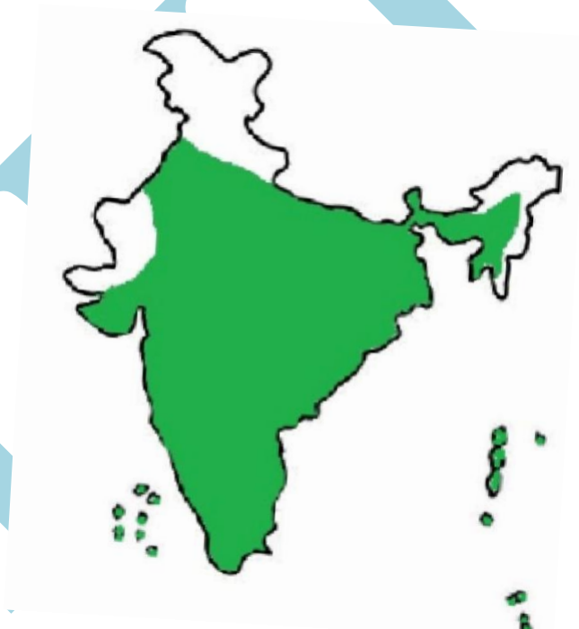
Fig: Distribution of Phyllanthus amarus in India.