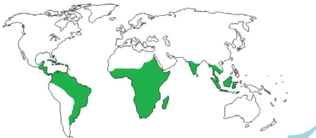
Fig: Worldwide distribution of Phyllanthus amarus .