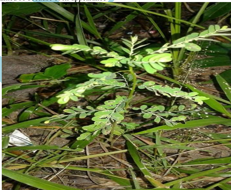
Fig: Habitat of Phyllanthus amarus as a wild plant.

flower, fruit and leaf appears fused. It is a worldwide distributed plant of tropical and subtropical region of planet. In India also most of places distributed Phyllanthus amarus plant. Distribution of Phyllanthus amarus found in in India, South Indian states, Maharashtra, Madhyapradesh, Uttarpradesh, Bihar, Jharkhand, North East States etc. in the district Patna Phyllanthus amarus plant found in Tal area of Patna district, Diyara land, Ganga and Punpun river side. Phyllanthus amarus found as a weed in cultivated land. Road side i.e. NH 31 also Phyllanthus amarus is found. Railway track side i.e. Howrah-Delhi main line also Phyllanthus amarus observed. Phyllanthus amarus also observed as a weed in garden.